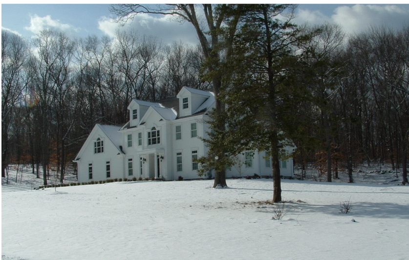
Typical Home Site

One of several existing new homes on estate sized building sites.