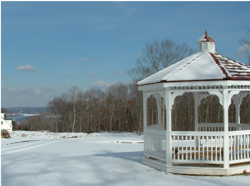
View from gazebo at Turnstone Road cul-de-sac